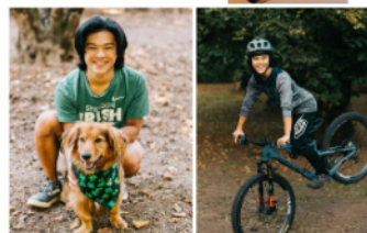
We Love You! Mom & Dad